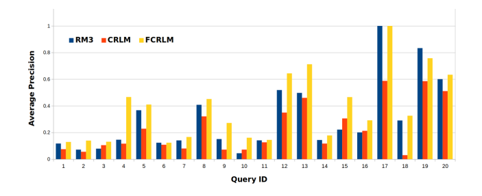
Figure 2: Per-query performance analysis in terms of average precision. Difference between blue and yellow bars indicates improvement of FCRLM over RM3 and CRLM.

SIGIR '20, July 25-30, 2020, Virtual Event, China